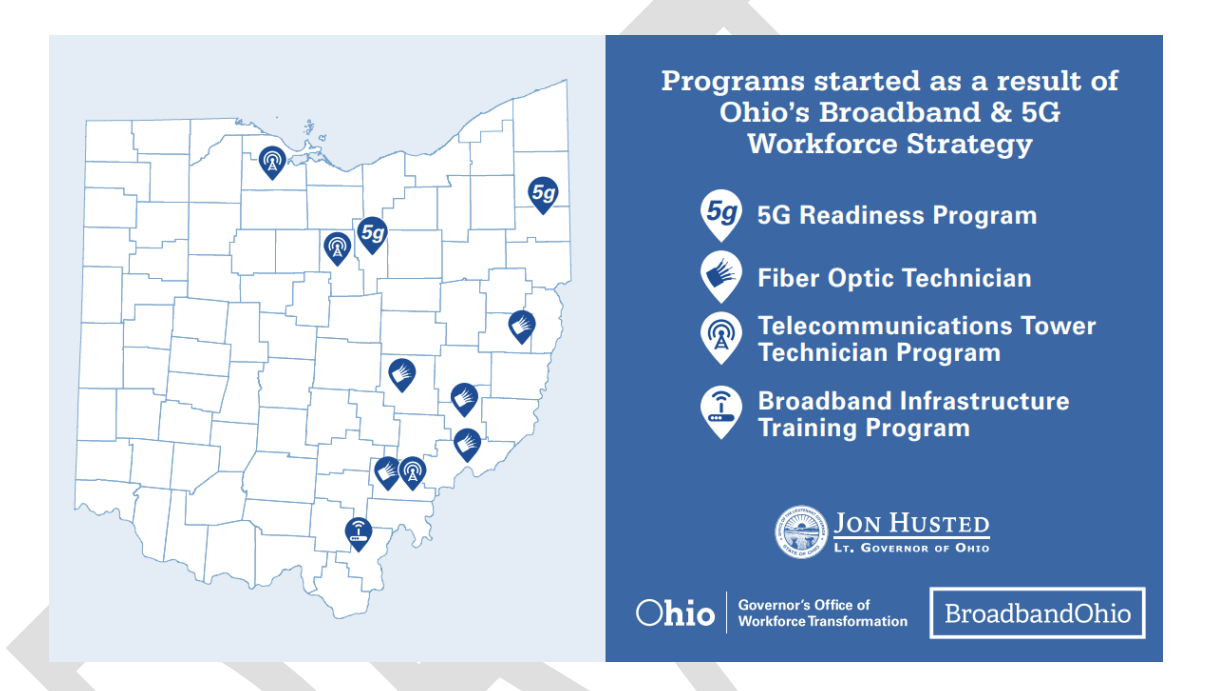
Exhibit 2: Current Program Map with the 11 training programs throughout the state

In addition, the "Broadband and 5G Connectivity Center" ("Connectivity Center") has been established and housed at The Ohio State University, to execute the statewide strategy set by the Sector Partnership. <sup>66</sup> This is where secondary and postsecondary education stakeholders, in partnership with industry, is mapping out the process to create a seamless ecosystem of curriculum and training programs geared for careers in the broadband and 5G industry that are implemented strategically at the smaller nodes, starting from mapping all the postsecondary programs in Ohio and identifying which could be quickly modified to integrate plug-and-play programs developed or distributed by the Connectivity Center. In the future, the Connectivity Center will