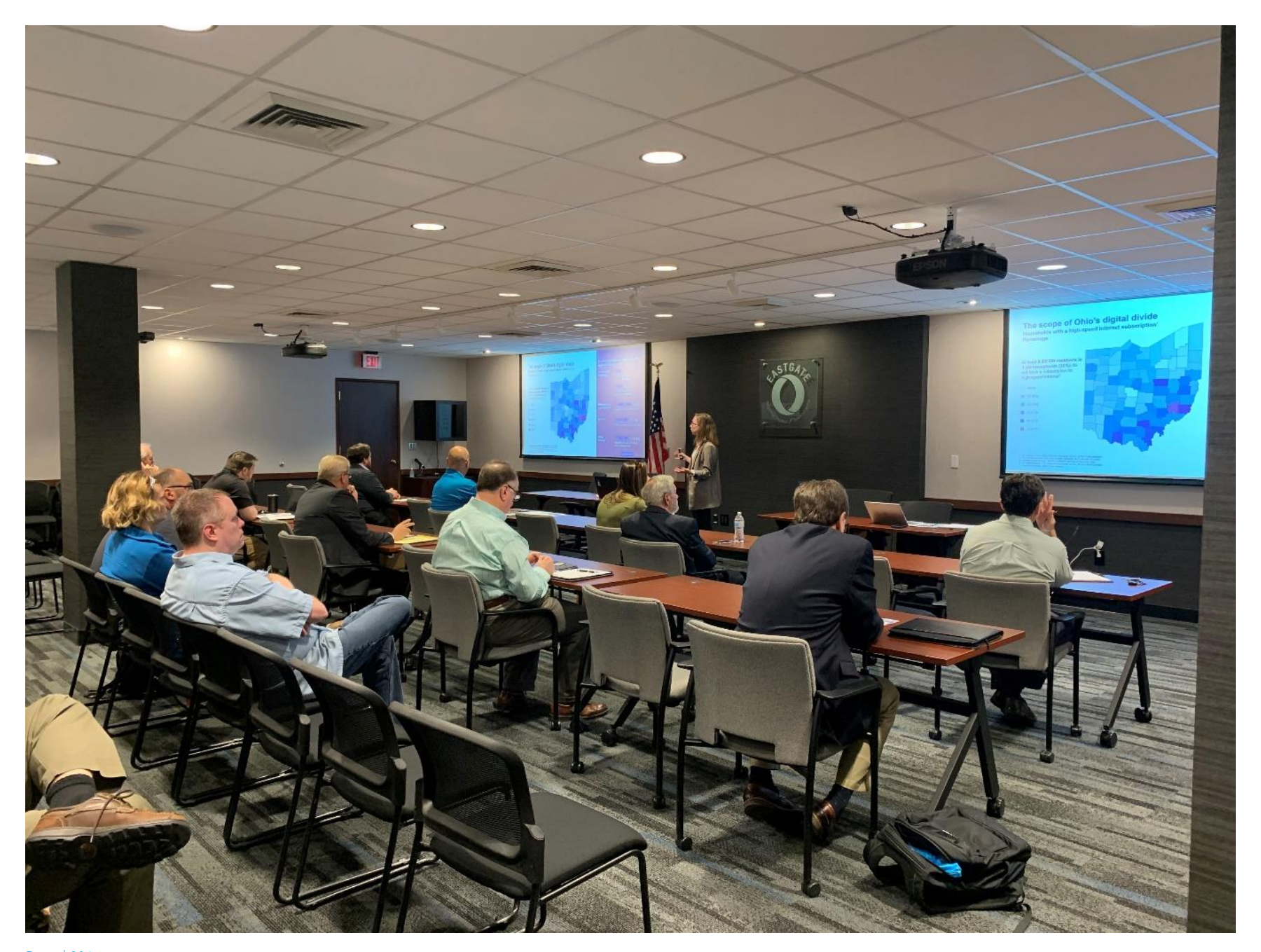
Page | 291